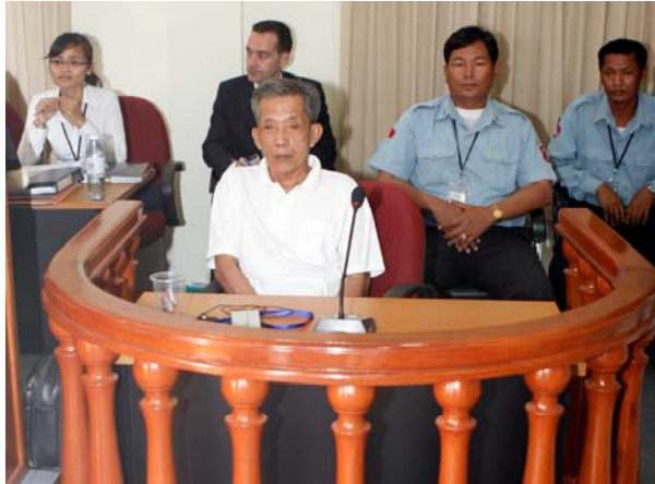
Duch, former head of Tuol Sleng prison, at his ECCC hearing

The ECCC's first public hearing was held on November 20. DC-Cam invited 40 victims of Democratic Kampuchea to witness the proceedings.