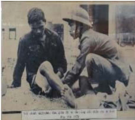
A Vietnamese soldier wounded in the war against the Khmer Rouge, on display at An Giang Museum