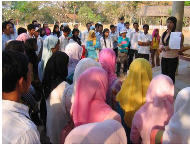
Explaining the essay contest to Cham students

To engage Cham Muslims in this project, young people were encouraged to write about their parents' experiences during Democratic Kampuchea and their views on the Cambodian genocide. Announcements were distributed along with notebooks and pens to 150 young people across Cambodia for this purpose. Thirty-three articles were received; they will be published in the Cham quarterly magazine.