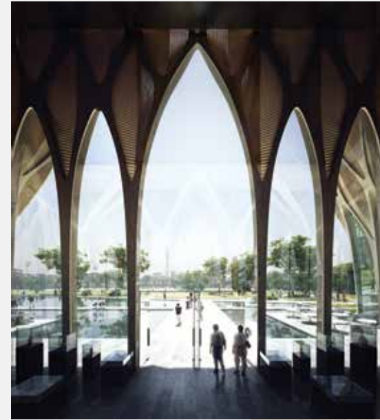
Above: THE SLEUK RITH INSTITUTE (Source: Designed by world-renowned Zaha Hadid, 2014)

SAN BUNSIM Mass Communication Officer Documentation Center of Cambodia t: +855 (0) 16 33 67 26 e: truthbunsim.s@dccam.org w: www.dccam.org